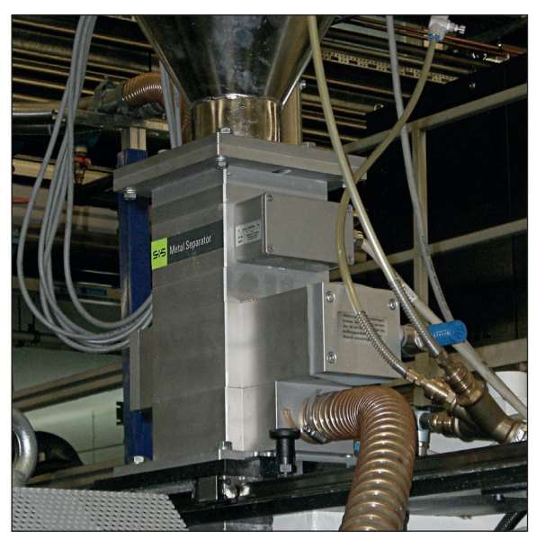
Installation example: Metal separator PROTECTOR installed over the feeder of an injection moulding machine (old version)

It detects all magnetic and non-magnetic metal contaminants (steel, stainless steel, aluminium, etc.) - even when they are enclosed in the product. Metal contaminants are ejected via the "Quick-Flap" separation unit.