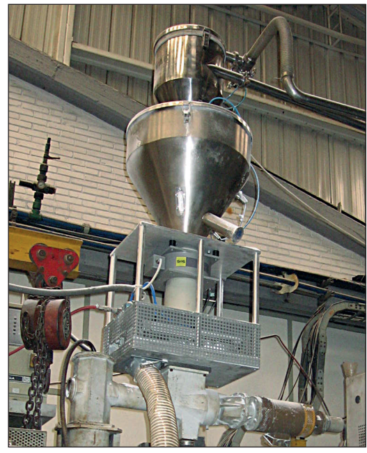
Installation example: Metal separator installed at the material infeed. (old version)

PROTECTOR-MF metal separators increase machine availability and productivity providing a fast return on investment.